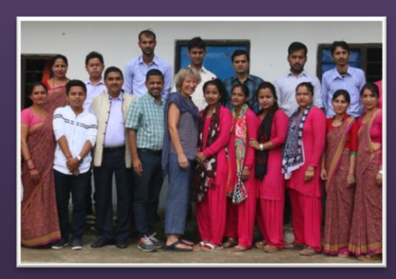
Fig. 5 EQUIP team with the school teachers pose for a picture

5. Weekly Camp: Asha Bal Bikash Sewa has a fun filled week at the centre. Every year ABBS organizes a weekly camp to celebrate children's day. The weekly camp is filled with fun games and