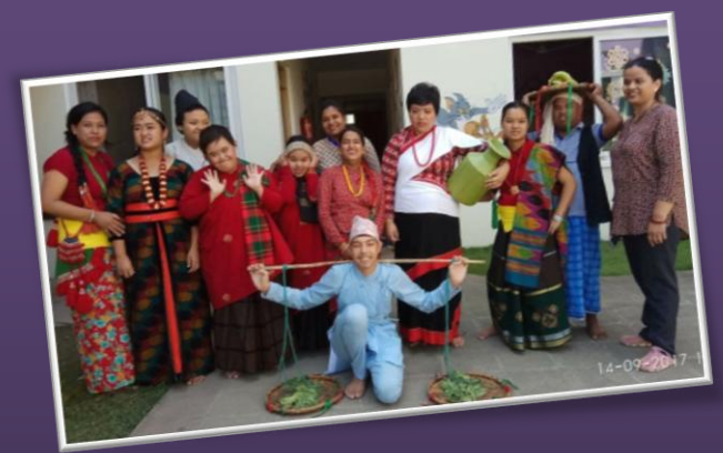
Fig. 4 ABBS children in their cultural dress activities for the children.

with the school health clubs and to promote health issues. Currently, PHP is spreading awareness about HIV aids and menstruation hygiene due to the high number of teenage pregnancy and HIV aids.