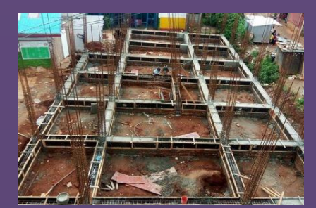
Fig. 1.1 CHR Maternal Ward Construction

Also the Kathmandu International Study Centre(KISC) will be moving to its new site in Thecho, Lalitpur by this December, KISC is also fundraising to complete the school building.