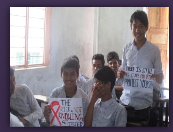
Fig. 3 During the HIV awareness sessions

4. School Health Program: Public Health Program started its 1st quarterly School Health Program in Lamjung in 8 village municipalities. The program is a combination of health awareness classes, reproductive health education, water and sanitation. The PHP also distributes education material, water jar, and soaps according to the needs of the school health. This program is created to engage